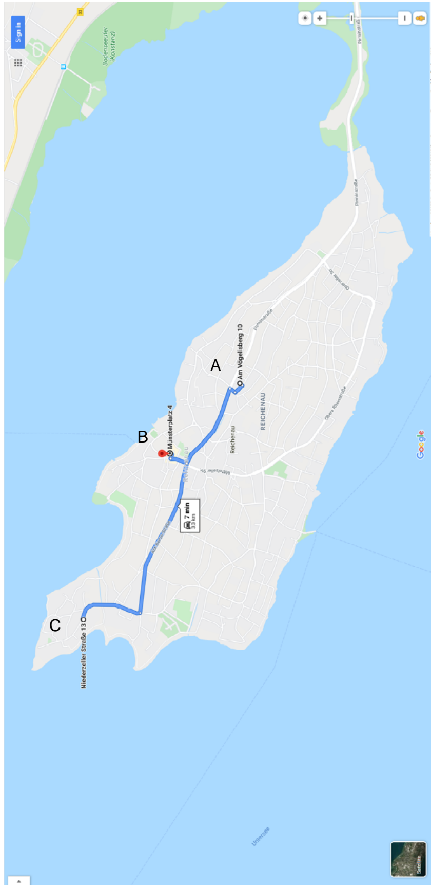
Locations of Restaurant Bütetzettel (A), Cathedral St. Maria and Markus (B), and greenhouse vegetable production farm (C) on the Island of Reichenau in Lake Constance.